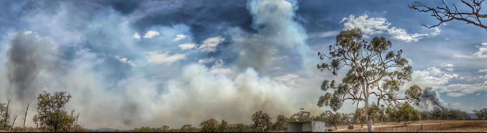
The view from Little Oak on Friday night, 29th November 2019