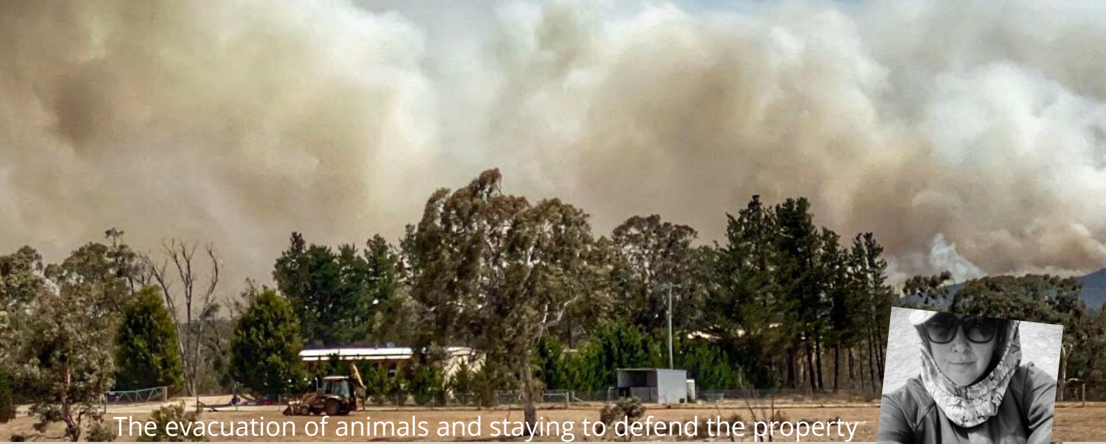
The evacuation of animals and staying to defend the property