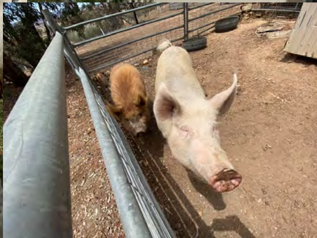
Little Oak Animals during their Evacu-stays