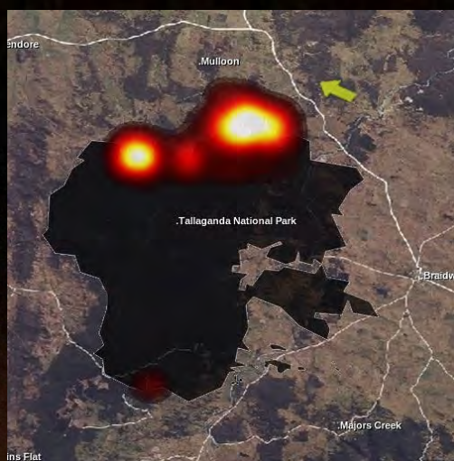
The green arrow shows where Little Oak Sanctuary is in relation to the Tallaganda/North Black Range fire (and active hot spots before the fire was finally marked contained)