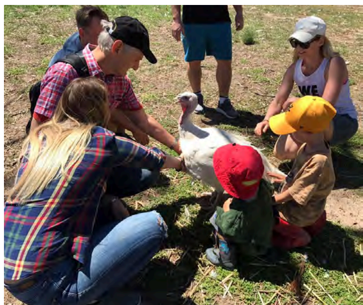
2017 Team Compassion Fundraising members visit Little Oak