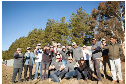
Teradata Corporate volunteering group

We aim to complete the fencing for these yards in early 2018, allowing us to move our existing poultry to the new area and rest the old yards.