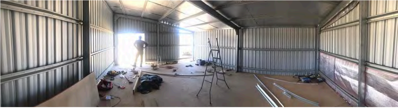
The "Sharing Shed"